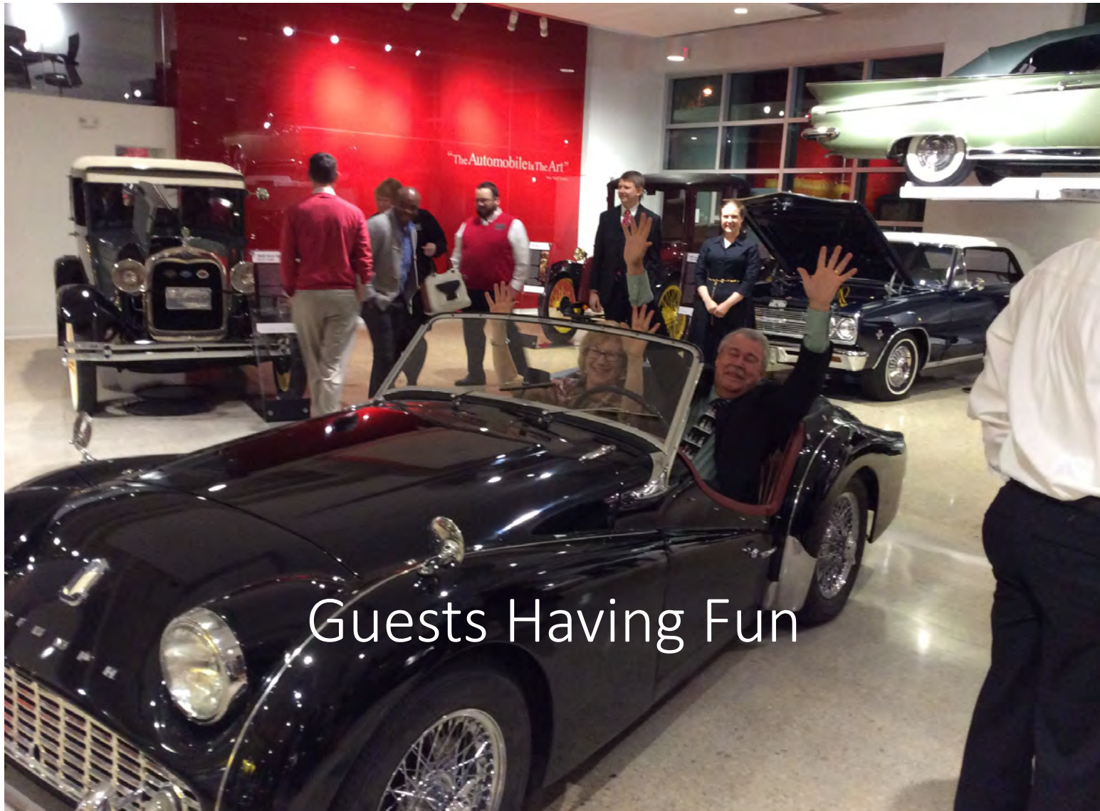
Guests Having Fun